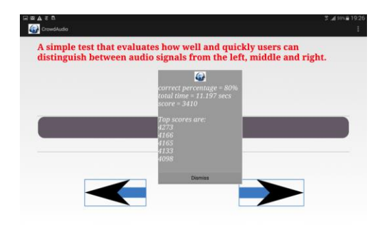
Figure 5. Results are summarized following the test.

perhaps be outweighed by the advantages of the availability of large amounts of data.