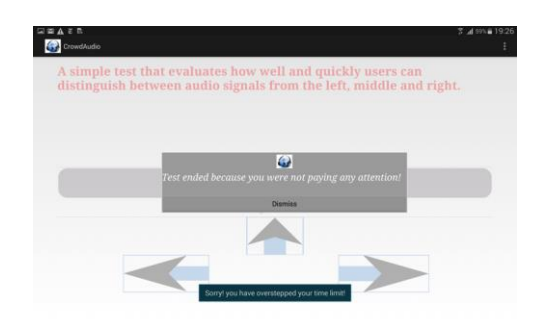
Figure 4. Tests are aborted when user is apparently not paying attention.