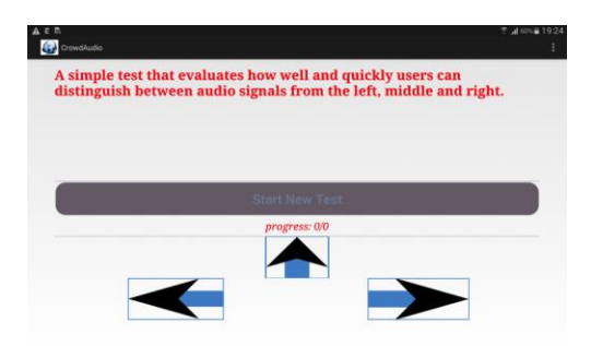
Figure 2. Basic experimental setup.