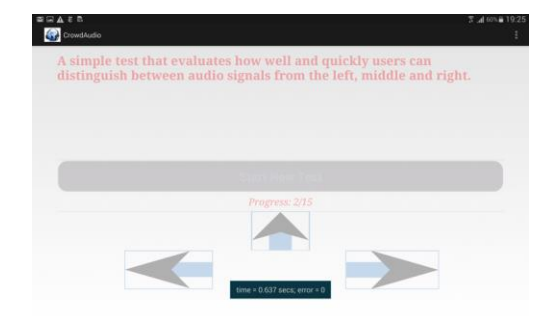
Figure 3. Feedback on correctness and measured time delay following each test question.

An important question in the long run will be whether enough data can be collected in crowdsourced settings such that differences in devices and testing protocols can be compensated for in a statistical sense. If the answer is in the affirmative, and statistically rigorous approaches are used, then the disadvantages associated with the lack of fixed latency can