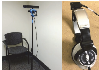
Figure 2. Left photo shows the Kinect mounted on a stand aimed at the chair used for seated positions. The right photo shows headphones with the IntertiaCube3 mounted on top.

Participants underwent four measurement conditions, mentioned previously, in randomized order and one minute breaks between conditions to relax.